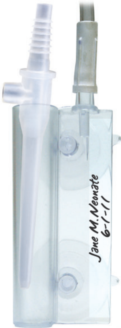
Little Sucker placed in Suction Caddy and suction capped off. Little Sucker not included.

Suction Device Holder to Store and Reuse the Neotech Little Sucker and Other Devices