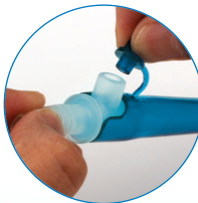
Little Sucker Cover with convenient cap off for thumb port.